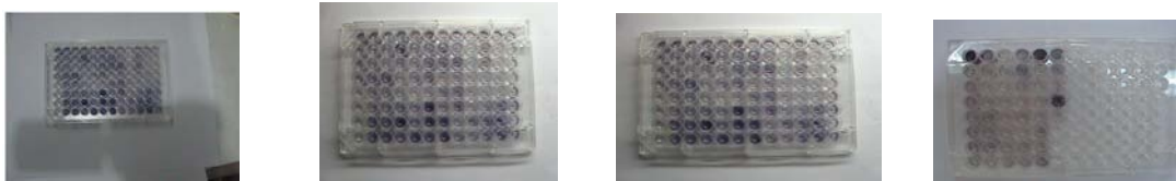
Fig 2. ELISA results of fruit juices and milk shake samples (1-300)

enhance growth of the target organism. Gram staining shows rod shape, pink E.coli .